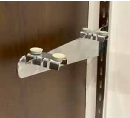
Left side, bracket shelf rests