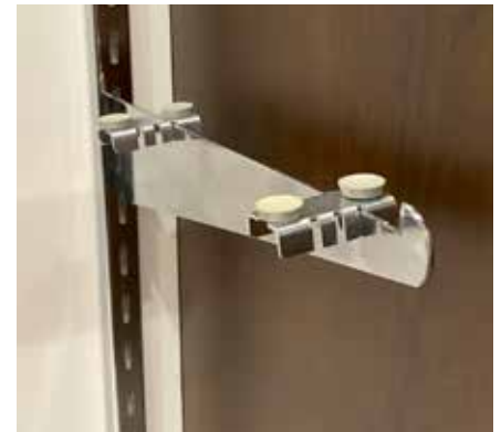
Right side, bracket shelf rests